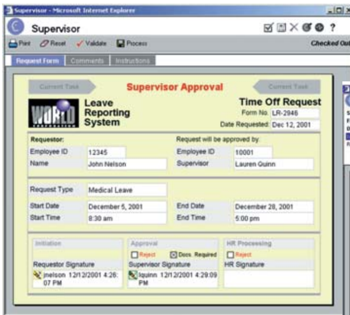
Panagon eForms supports roles-based digital signatures within a single eForm.

The Panagon eForms Step Processor supports prefilled data fields, and extensive validation to minimize costly error exception handling.